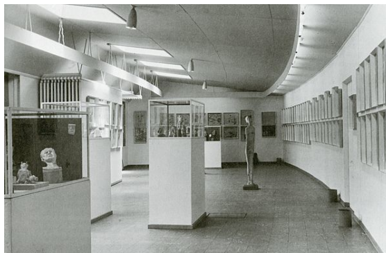
Netherne Gallery. Adamson Collection Trust.