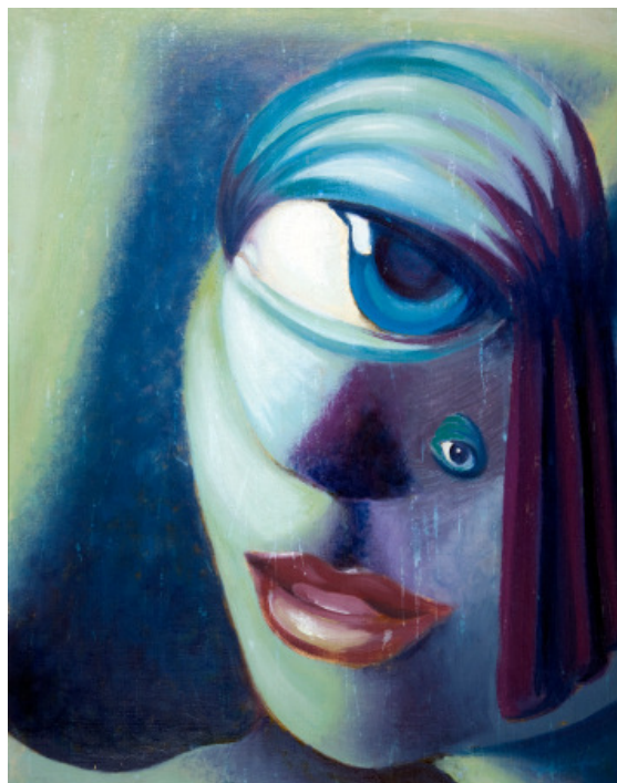
"The Tear", anonymous, acrylic on canvas.